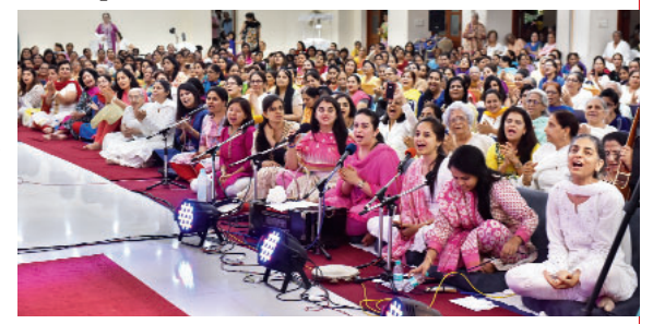
audiences across age The launch was attended by a large number of people

His 10 city 'Heart 2 Heart' tour covering melodious ghazals kicked off in Mumbai yesterday and will further move to Bangalore, Pune, Hyderabad, Kolkata and other cities