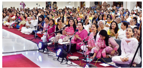
The launch was attended by a large number of people

His 10 city 'Heart 2 Heart' tour covering melodious ghazals kicked off in Mumbai yesterday and will further move to Bengaluru, Pune, Hyderabad, Kolkata and other cities.