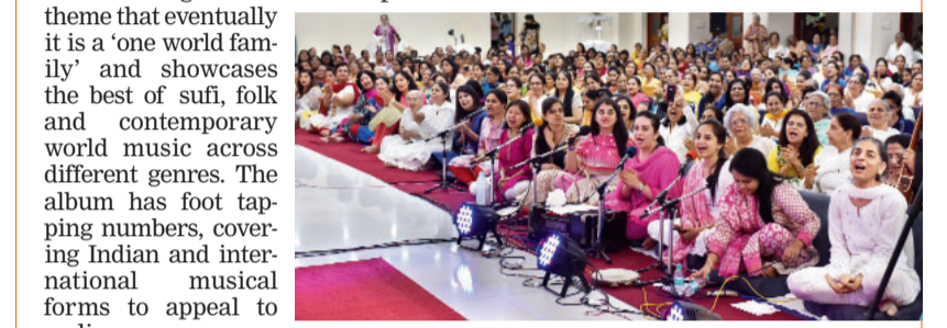
The launch was attended by a large number of people

His 10 city 'Heart 2 Heart' tour covering melodious ghazals kicked off in Mumbai yesterday and will further move to Bangalore, Pune, Hyderabad, Kolkata and other cities.